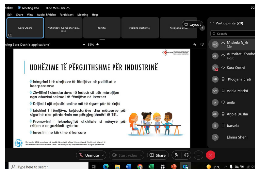
Photo from trainings with Child Protection Unit

The purpose of the trainings was to increase the awareness of students, parents and teachers, child protection workers and Internet Service Providers on the potential cyber risks that children encounter while surfing the Internet, as well as education on ways to report illegal and harmful content. The statistics of the trainings are: