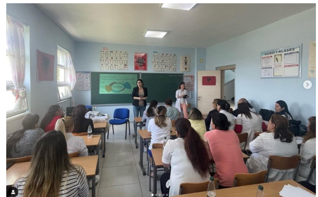
Photo from trainings with parents and educators

Within the framework of the implementation of the Action Plan of the "National Strategy for Cyber Security 2020-2025", NAECCS has continued to organize online and onsite awareness campaigns, with participants from public and private institutions, parents, teachers, children and young people, in different regions of Albania.